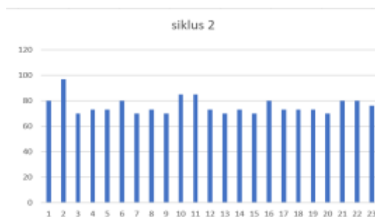
Picture 3. Student's Score of cycle 2

The results of the reading comprehension test in cycle 2 are as follows :